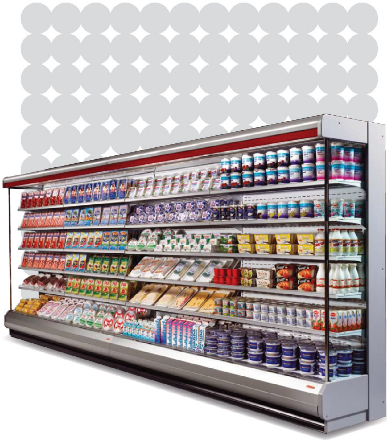
Avon: Slim Maxi